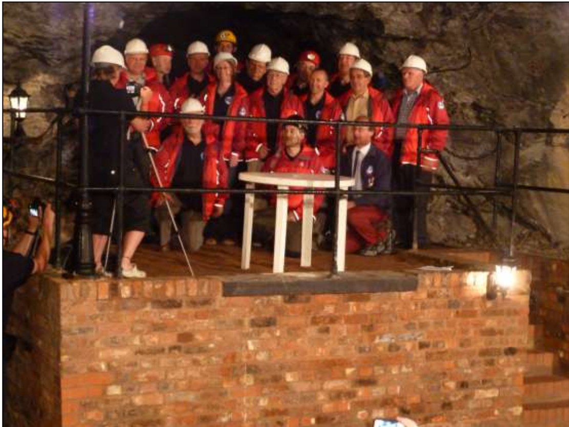
MCRO members at the presentation

More photos of everybody getting back onto the boat and then it was along the tunnels backwards all the way and out into the warm summer's evening. The conclusion of a fantastic evening and one that I know that Rose and I are very proud to have been part of.