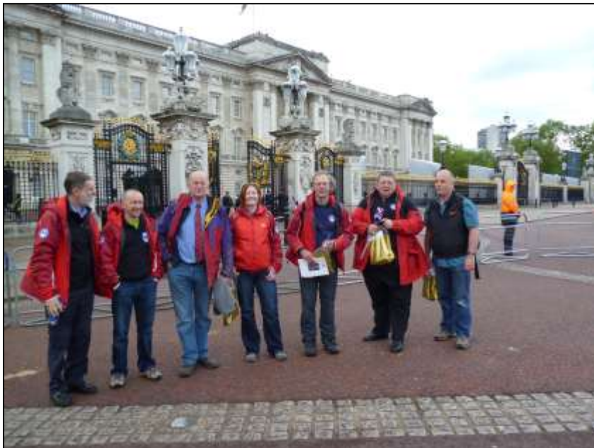
Outside Buckingham Palace