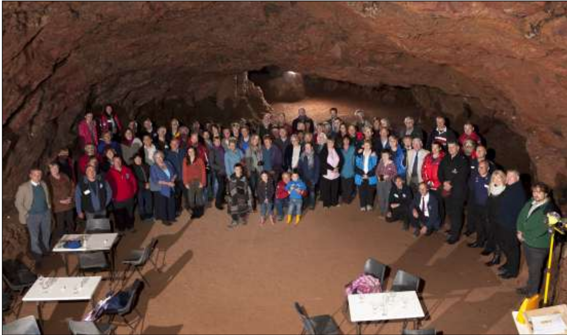
All attendees of the presentation in Clearwell Caves

It is fair to say that there is only one word that describes the evening "Fantastic" and thanks are extended to all who took part and organised the event. It will go down in the history of the group and be remembered for a very long time.